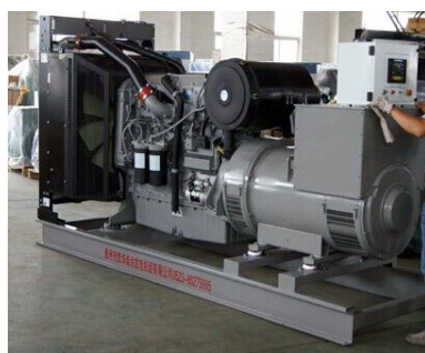
500KW perkins gensets exported to Iran