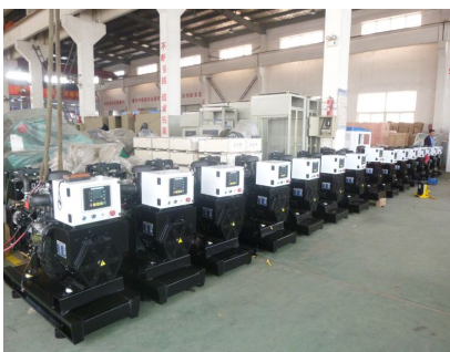
20 units perkins gensets exported to Tanzania