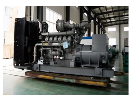
1250KW perkins gensets exported to Pakistan