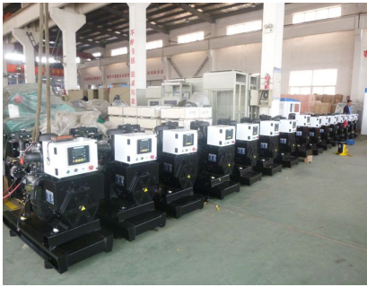
20 units perkins gensets exported to Tanzania