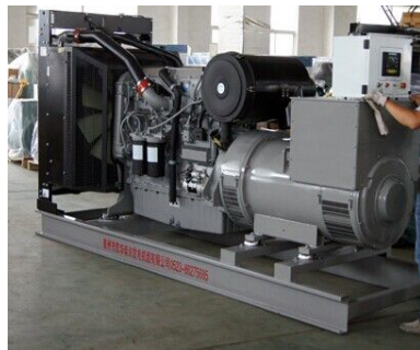
500KW perkins gensets exported to Iran