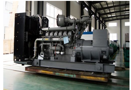
1250KW perkins gensets exported to Pakistan